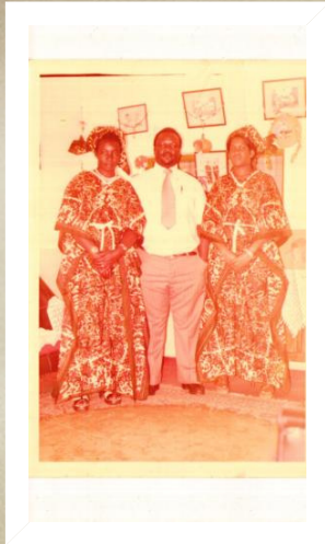
Mum1, Dad, Mum2